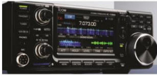
Prize (1) Icom IC-7300 HF 160-6 M DSP Transceiver

Order your Prize Tickets early! Be a WINNER – Be a WINNER