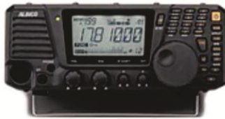
Prize (2) Alinco DX-SR-8T HF 160-10 M Transceiver