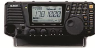
Prize (3) Alinco DX-SR-8T HF 160-10 M Transceiver

Prize 1, Prize 2, Prize 3, Drawing is on Saturday 8, 2017 at 1:00 PM - You DO Not have to be present for Prizes 1,2,3, The hourly prizes you DO have to be present to win.